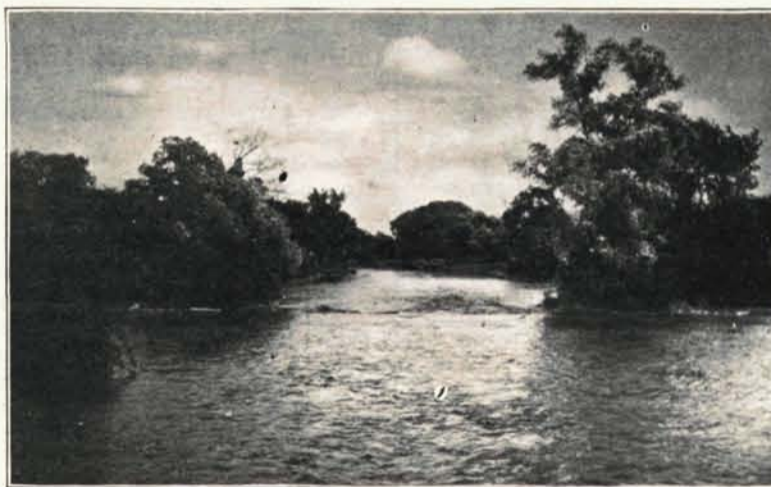
THE SENECA RIVER AT WATERLOO, N. Y.

"In 1903 the Vough Co. placed on the market an instrument that at once made itself known to the enterprising dealers in all parts of the country. This was the Vough 'Changeable Pitch' piano, the pitch of which can be changed from low or international pitch to high or concert pitch by simply moving a knob. Because of the advantage in having both pitches in a piano of the best quality, musicians, teachers and lovers