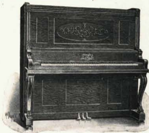
VOUGH CHANGEABLE PITCH PIANO.